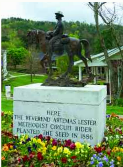
Statue of Artemas Lester

Erected in 1986 upon the centennial anniversary of YHC's founding by circuit-riding, Methodist minister Artemas Lester, this statue stands between the Charles R. Clegg Fine Arts Building and the Hesed House.