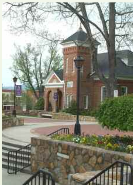
Campus Plaza and Susan B. Harris Chapel

Redesigned and renovated in 2001, YHC's campus plaza is now home to hundreds of personalized bricks and a three-foot diameter rendition of the college seal. (Get your own brick! See page 25 for details.)