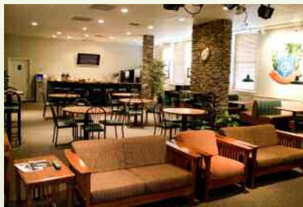
Myers Student Center

Renovated in 2003, Myers Student Center is housed on the first floor of Sharp Hall. Despite the fact that this building is more than 90 years old, it offers a wireless Internet connection, two widescreen televisions and a self-serve coffee bar. Pool tables provide a respite from studying, and a variety of seating arrangements encourage conversation and contemplation.