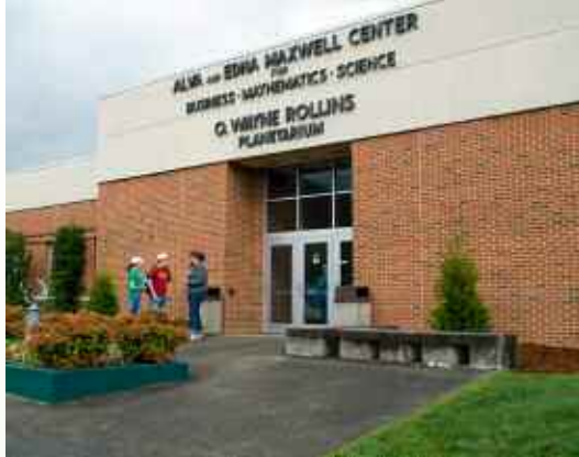
O. Wayne Rollins Planetarium

planetarium in the state of Georgia. With a 40-foot dome and seating for 109 people, the planetarium features a GOTO Chronos star projector and many other special effects. Following Friday evening shows and dependent upon clear skies, stargazers may also visit the YHC observatory located on the nearby grounds of Brasstown Valley Resort.